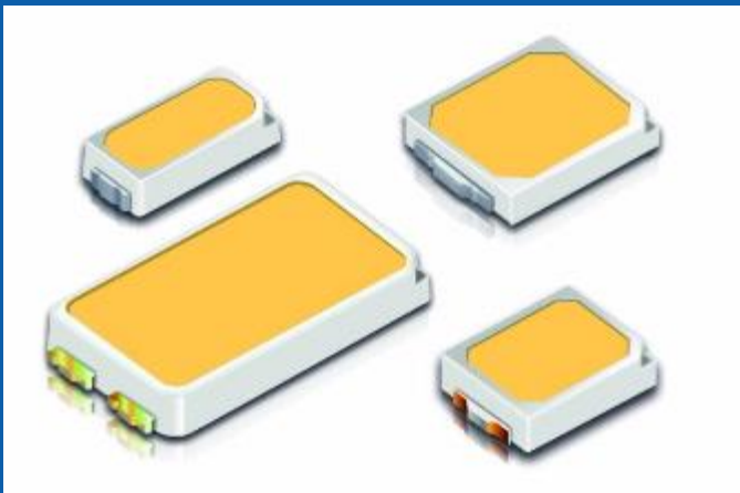
Industry standard packages including: 2835, 3014, 3030 & 5630

The portfolio also comprises of nominal flux levels from 20 -140 lm, typical viewing angle of 120°, high-voltage, super-efficient, and three-step MacAdam ellipse (SCDM) as standard and single-step MacAdam ellipse (SCDM).